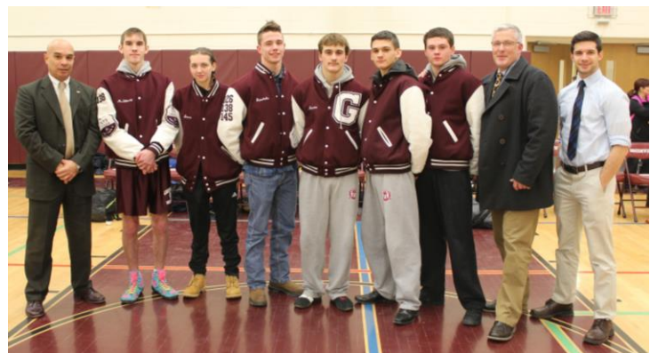
Senior Wrestlers with Coaches (To Right)